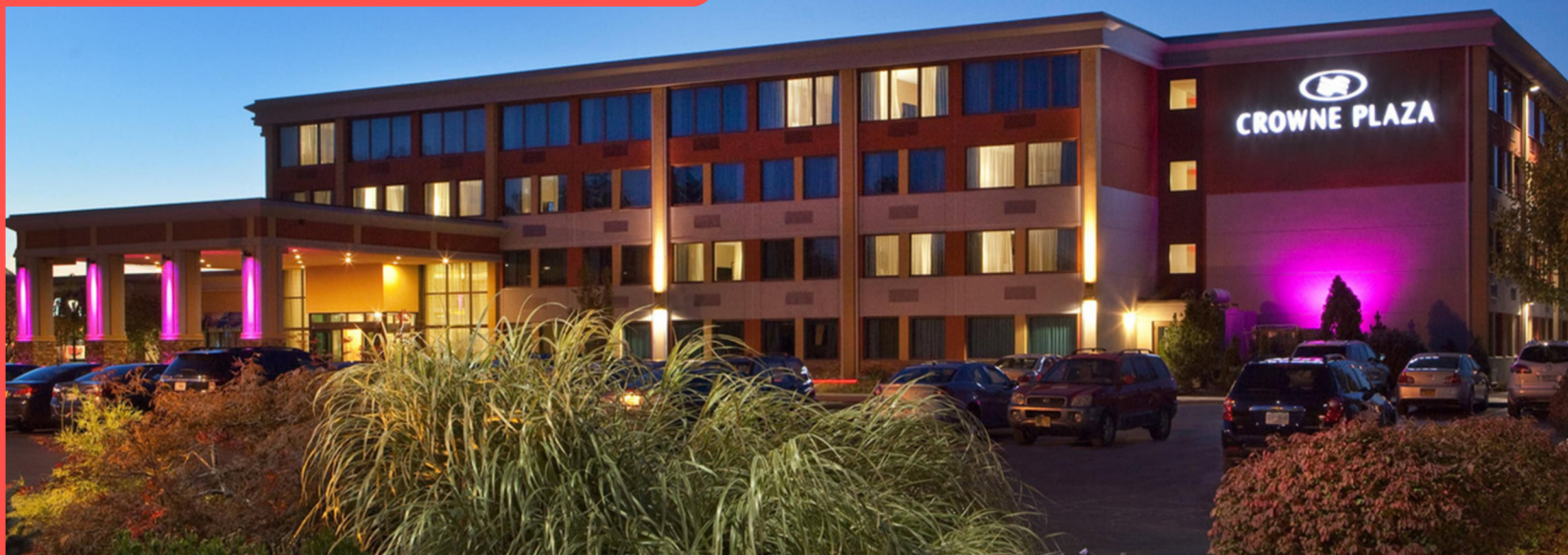
Crowne Plaza, Woburn

A stroll through our ten year timeline, recognitions and awards, a great theme show, the Trading Post, special guests and much more! Don't Miss Out. Register Today in the Lodge website.