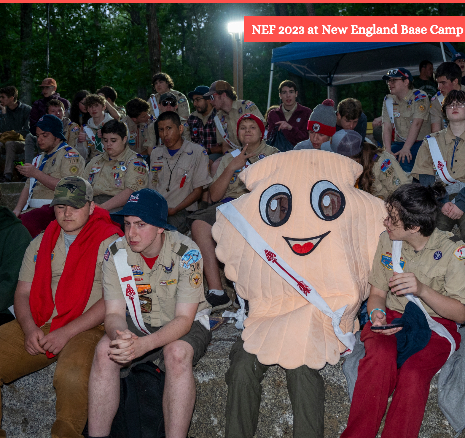
NEF 2023 at New England Base Camp

If you were in awe of the ceremonies performed, consider becoming part of our ceremonialist team or joining 15 Blazes and work behind the scenes to make each and every ceremony perfect. Ordeals are the most important event we hold and your help is needed to deliver an excellent candidate experience. Sign up for the June ordeal today on the Lodge website!