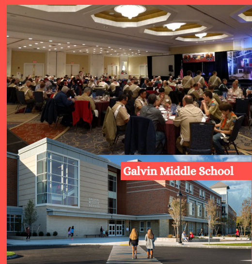
Galvin Middle School