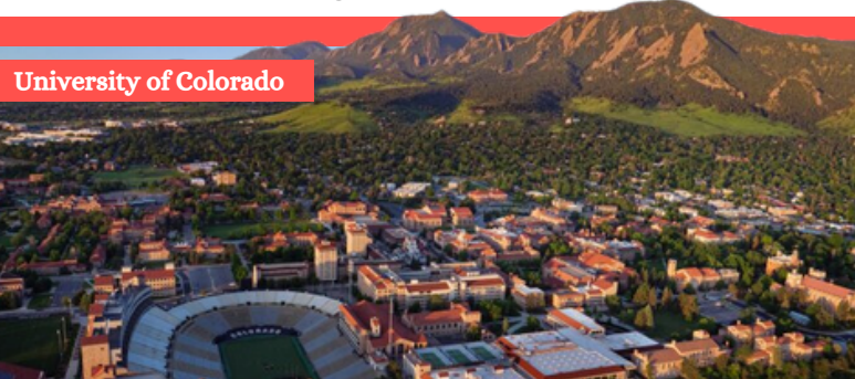
University of Colorado

There are only a few spots left for this once in a lifetime chance; sign up while you can! NOAC 2024 is fast approaching, and the lodge cannot wait to set off for the University of Colorado. Pennacook will not only be partaking in NOAC but will also take another week to explore the western United States. We will be adventuring at Philmont Scout Ranch, cutting through the white-water rapids of the west, and hiking and camping in Rocky Mountain National Park. Don't miss out on a chance to see the country and celebrate the Order of the Arrow. For more information, visit the lodge website at www.oapennacook.org