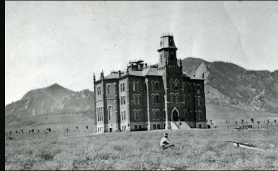
“Old Main” in the late 19 th century

Founded in 1876, at CU Boulder, undergraduate and graduate students put their knowledge to use in areas of study ranging from archaeological finds in the arctic to improving the classroom experience to working with NASA to conduct research in space. CU Boulder is a member of the prestigious Association of American Universities and is one of the most beautiful campuses in the nation.